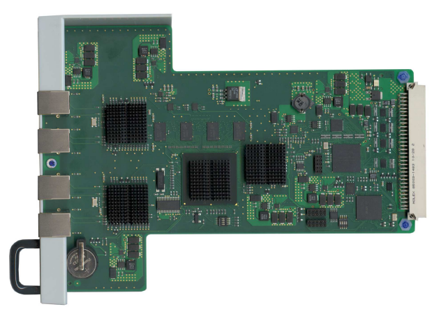
3201 Node/Chassis Processor Card